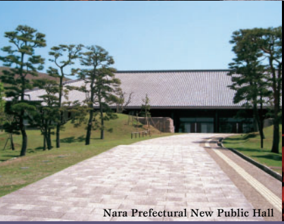
Nara Prefectural New Public Hall