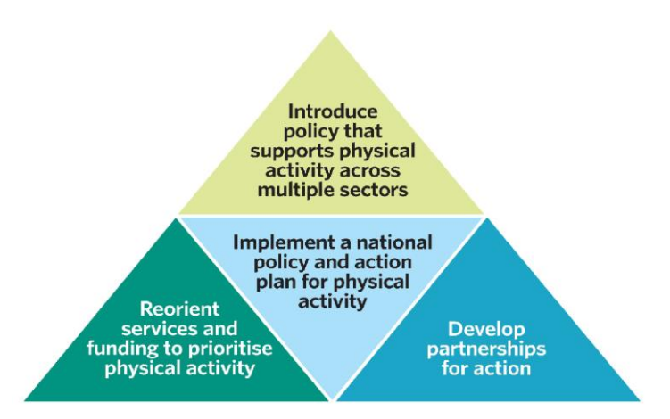
Figure 2 The Toronto Charter platform for Action: Four Areas

several government portfolios, and the multiple co benefits available from increasing population levels of physical activity. The third section sets out nine principles for action which are consistent with contemporary health promotion and global public health practice. The fourth section provides a framework of four priority areas for strategic action which are relevant and applicable to all countries and consistent with scientific evidence. These are: 1) develop and implement national strategy; 2) introduce polices and regulations; 3) provide and reorientate programs, services and supportive environments; and, 4) develop partnerships for action. These are shown in Figure 2 and in the charter itself each area has a brief description and a set of examples.